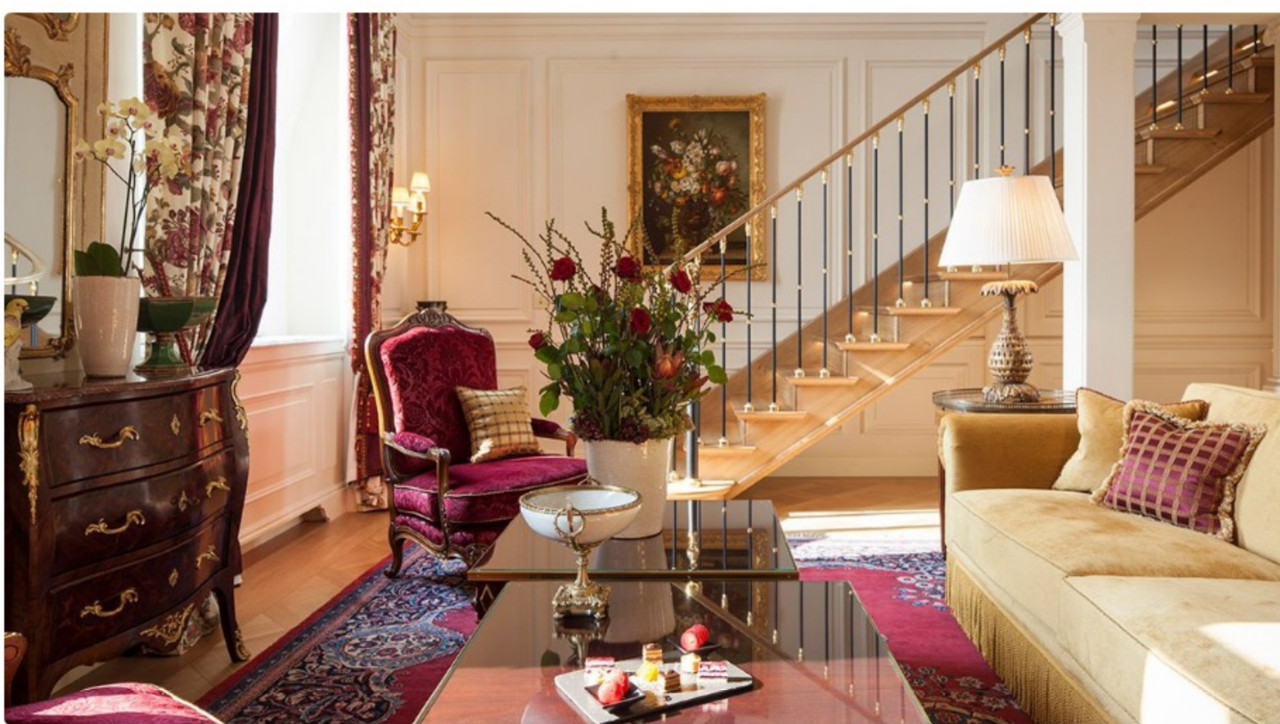
Beau Rivage Geneve – Suite