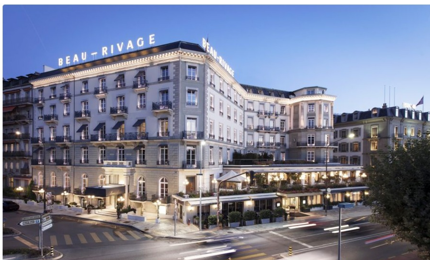
Beau Rivage Geneve

Beau-Rivage has rooms starting from CHF490 (approx. £400) per night, based on two adults sharing a Classic Room on a room-only basis. For further information on Beau-Rivage or for bookings please visit beau-rivage.ch or telephone +41 22 716 66 66.